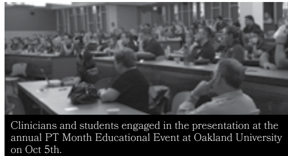
Clinicians and students engaged in the presentation at the annual PT Month Educational Event at Oakland University on Oct 5th.