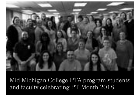
Mid Michigan College PTA program students and faculty celebrating PT Month 2018.

Mid Michigan Community College is now Mid Michigan College. The college continues to serve Clare and Gladwin counties and their immediate areas. The college has grown far beyond its early geographic borders by expanding dual enrollment programs with intermediate school districts located hours away from the campuses in Harrison and Mt. Pleasant. Today, the college has a strong international student program with students from several countries across the globe. Mid Michigan College has also focused on growing our partnerships with industry to include several programs in the skilled trades and manufacturing. The name change will position our students for greater opportunities in transfer programs and in job recruitment for the future.