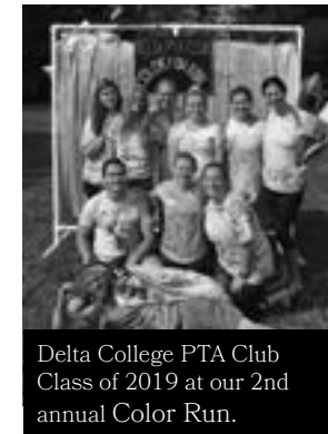
Delta College PTA Club Class of 2019 at our 2nd annual Color Run.