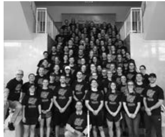
GVSU Class of 2020 and 2021 participate in Day of Service Activities