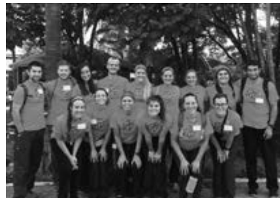
GVSU Class of 2019 Students participate in Hearts in Motion in Guatemala