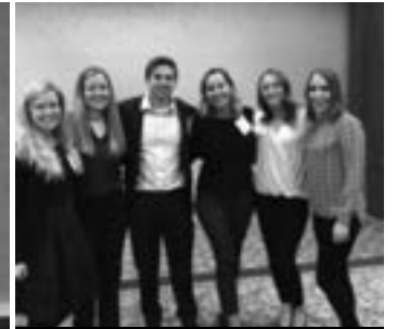
Oakland DPT students at MPTA fall conference