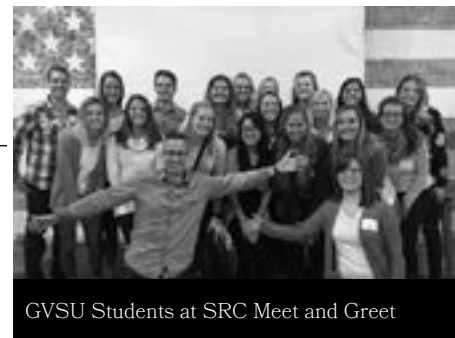
GVSU Students at SRC Meet and Greet

The SRC board meetings are open for anyone to attend. Email mpta.src@gmail.com or contact your school's SRC student representative if you are interested. The SRC is a great committee to be a part of if you are looking to advance your leadership skills, make connections with students from various Michigan schools, and help make MPTA Student Conclave possible!