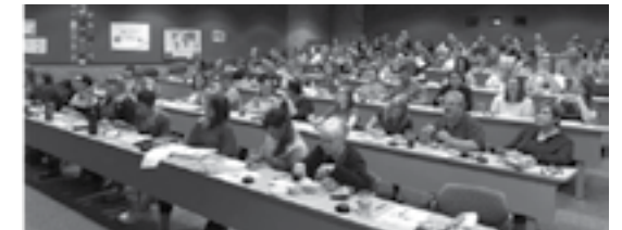
Members attending our September Course: Symptomatic SI Joint @ Delta College