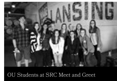
OU Students at SRC Meet and Greet